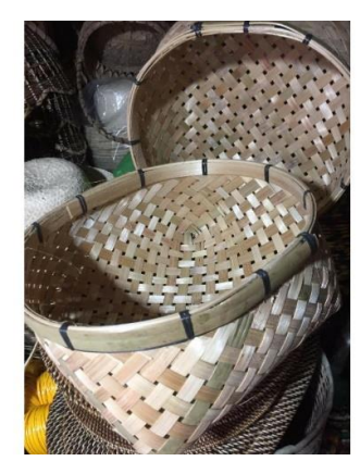
Figure 4. Specification of Egg Catcher