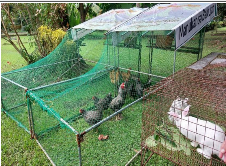
Figure 2. Specification of Chicken Coop