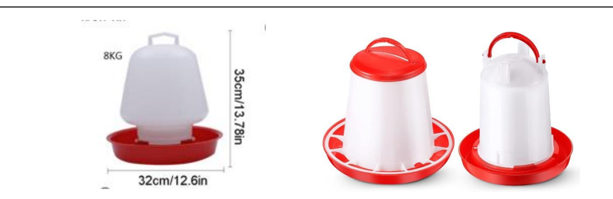
Figure 3. Specification of drinker and feeder