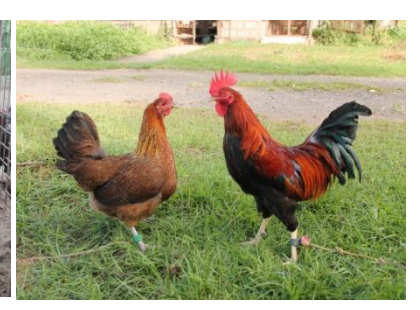
Figure 1. Specification of Chicken.