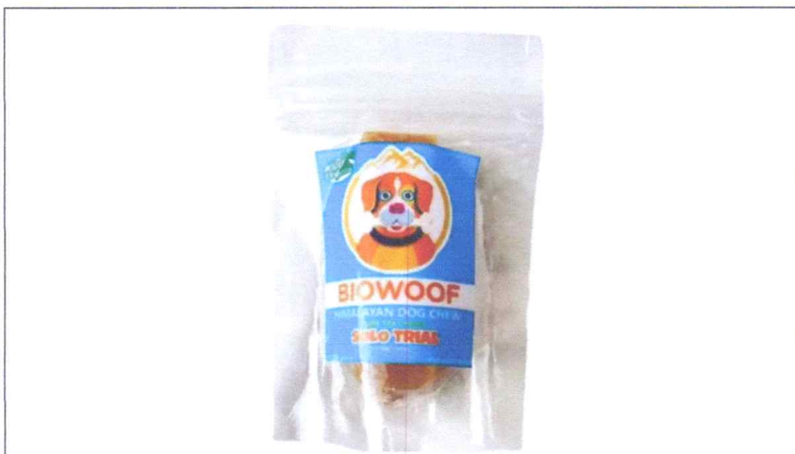
Figure 1. Unregistered Specialty Feed Product

The Bureau of Animal Industry (BAI) advises the public against the selling, purchase and use of BIOWOOF HIMALAYAN DOG CHEW - SOLO TRIAL (see the picture below).